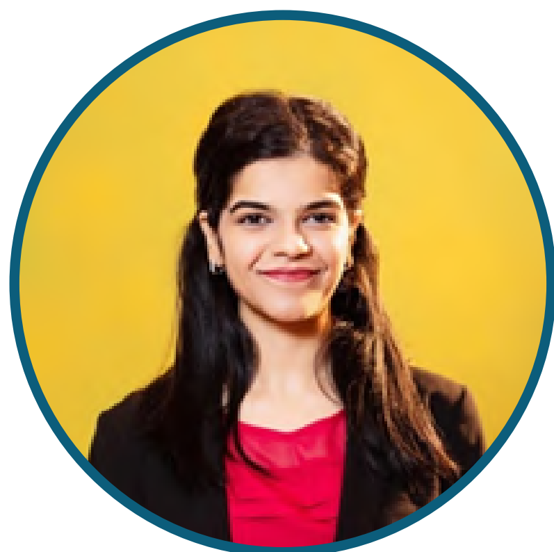
Miss. Aishwarya Rai