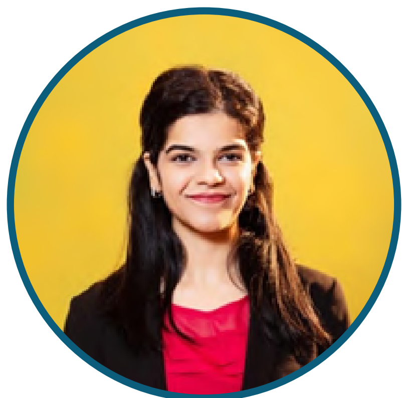
Miss. Aishwarya Rai